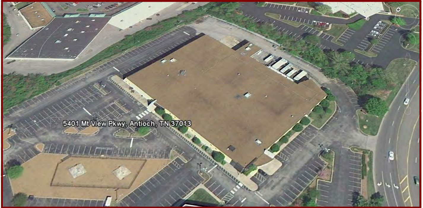
Aerial View of Building