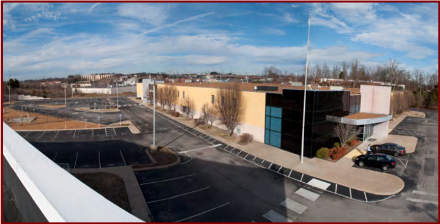
Front and Side view of building

Karr Commercial, LLC / Karr Realty, LLC, 5633 Charlotte Avenue, Suite 201 Nashville, Tennessee 37209 615-352-1161 615-352-1414 fax