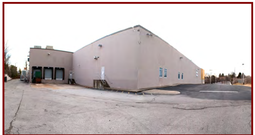
Rear view of building—Loading docks