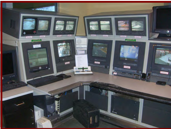
Central Security Station