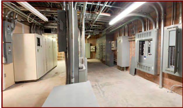
Main Electrical Room