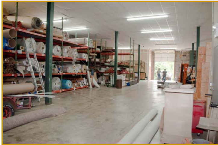
Clean and Well Lighted Warehouse Area