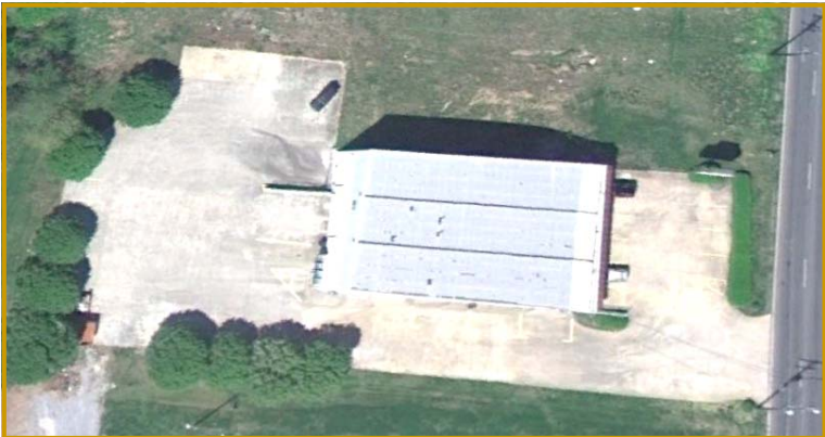
Aerial view showing large truck turn-around area