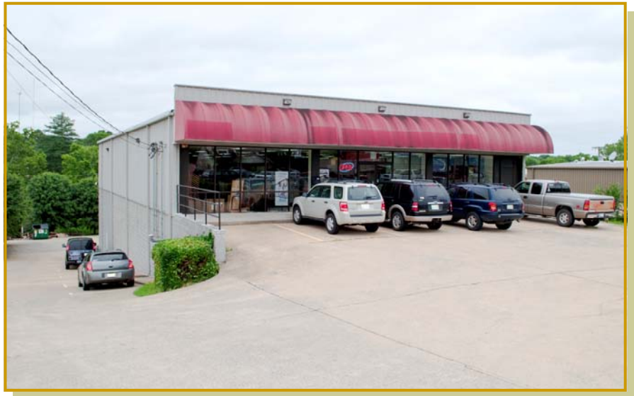
Front View of Building

1 - 10' drive-in door 1 - Dock high door 15' Ceiling Height Large area for truck turn around