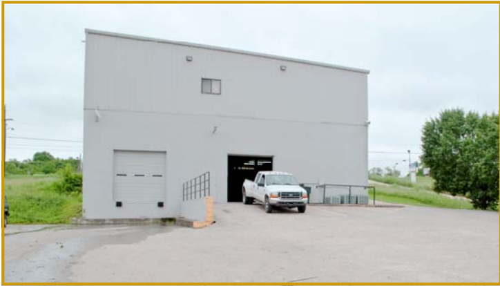
View of Warehouse